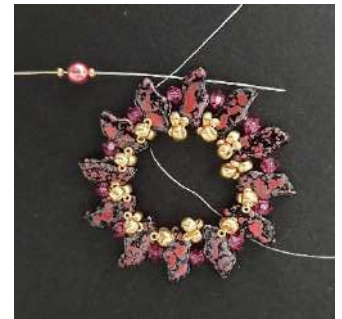
12) Place 1 K15, 1 P4, 1 K15 between each Delos (3rd hole)