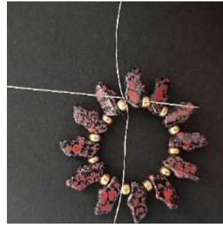
3) Pass through the Delos, the R8