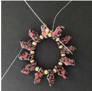
5) Thread through the Delos and the next R8 and repeat step 4 all the way round