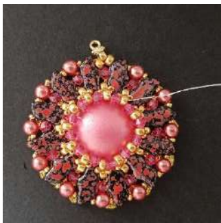
29) Place 1 T3, all around like this, tighten well