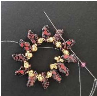
9) Place a T3, between each Delos (middle hole)