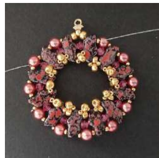
15) You get this