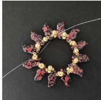
6) You get this