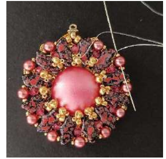
24) Repeat steps 21 to 23 all the way around