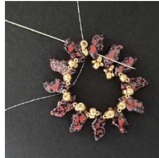
7) Pass through the Delos