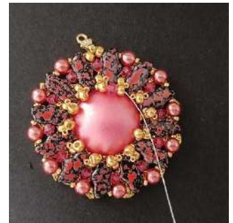
28) Like this