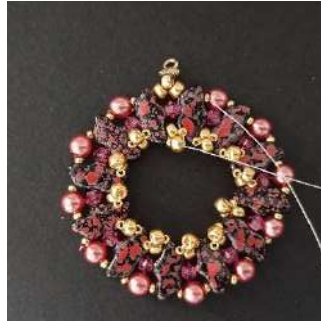
18) Then pass through the R15 and the R8