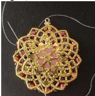
25) Like this