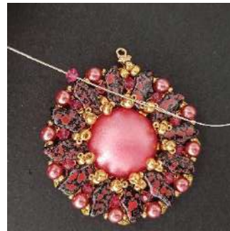
27) Thread the waiting thread. Place 1 T3 in the next R8