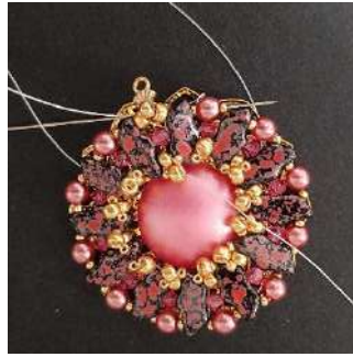
22) Pass through R15, P4, R15, then repeat step 21