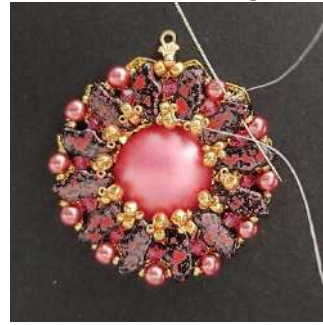
23) Pass through R15, the Delos