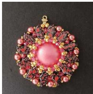
30) Tie a double knot, cut your thread