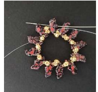
8) Pass through the 2nd hole of the Delos to turn back