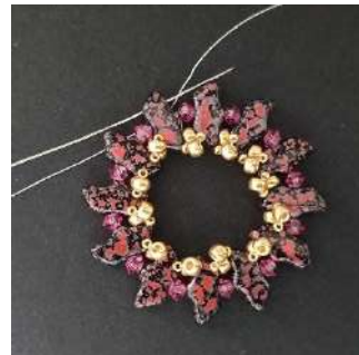
11) Pass through the 3rd hole of the Delos to turn around