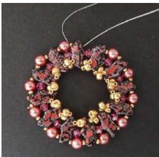
13) You get this