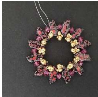
10) You get this