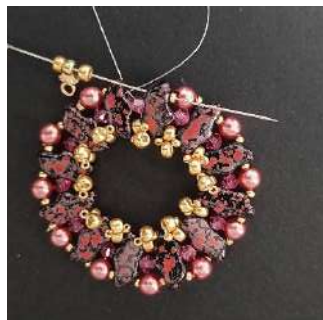
14) Finally, place 1 R8, 1 Pilos, 1 R8