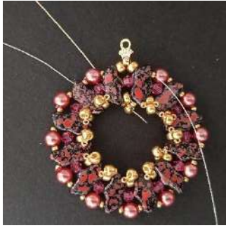
17) Like this