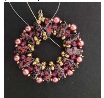
16) Thread your pending thread into the R8