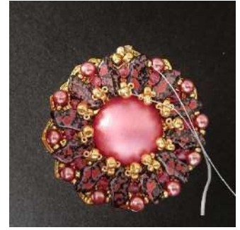
20) Placing Your Pearl Crown