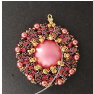
26) Once you have done all the way around, tie a double knot, cut your thread