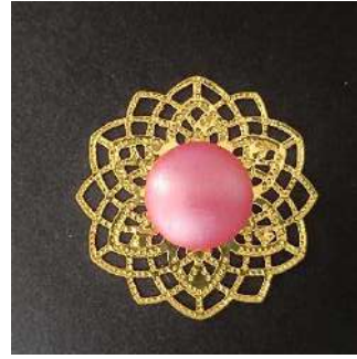
19) Glue your cabochon to the center of the filigree