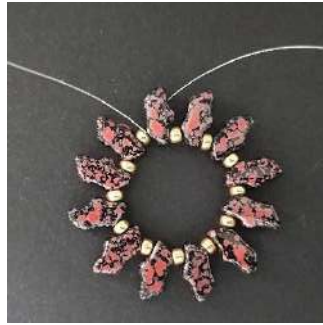
2) Leave approximately 30 cm of thread. Tie a double knot