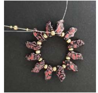
4) Place 1 R15, 1 R8, 1 R15 in the R8, like this