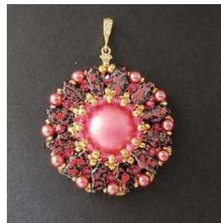
31) Place your bail. Is your pendant finished!!