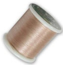
Ko Thread 0.25mm Natural x50 m Ref. : UFC-724 Quantity : 1