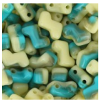
Zorro Bead 5x6 mm Dark Mint/Ivoire x50 Ref. : TCHE-327 Quantity : 1