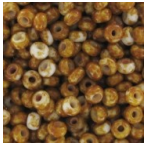
Seed beads 2,5mm Travertine x20g Ref. : ROC-157 Quantity : 1