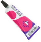
Jewel Glue Hasulith 30ml Ref. : OUTIL-007 Quantity : 1