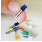
Assortment of 10 Mini Cutters for polymer clay Ref. : OTL-237 Quantity : 1