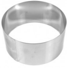
Big tin cutter for modelling 80 mm Round Ref. : OTL-107 Quantity : 1