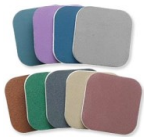
Grind'n polish set Micro-Mesh x9 Ref. : OUTIL-334 Quantity : 1