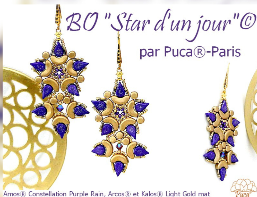
Amos® Constellation Purple Rain, Arcos® et Kalos® Light Gold mat