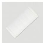
Sewing thread cotton DMC Tubino White x100m Ref. : SEW-048 Quantity : 1