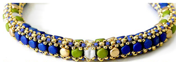
Bracelet "Michelle"© par Puca®-Paris

Kalos® Trendy Sienna Mat, Light Olive Mat, Mustard Mat et Light Gold mat