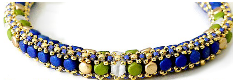
Bracelet "Michelle"© par Puca®-Paris