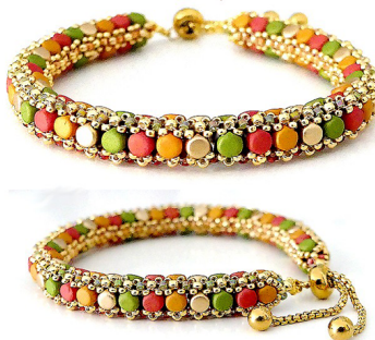
Bracelet "Michelle"© par Puca®-Paris

Kalos® Trendy Sienna Mat, Light Olive Mat, Mustard Mat et Light Gold mat