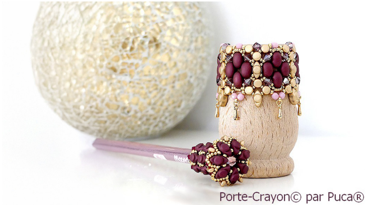
Porte-Crayon© par Puca®