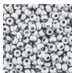
Mini Seed beads 2mm Argenté Gris Satiné x20g Ref. : ROC-443 Quantity : 1