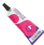
Jewel Glue Hasulith 30ml Ref. : OUTIL-007 Quantity : 1