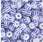
4mm Striped seed beads 6/0 - White - Blue x20g Ref. : ROC-701 Quantity : 1