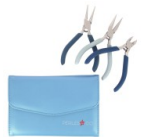
Kit of 3 pliers in Perles & Co pocket Blue x1 Ref. : OUT-336 Quantity : 1