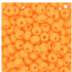
Seed beads 6/0 - 4mm - Opaque Orange x20g Ref. : ROC-793 Quantity : 1