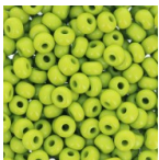
4mm Seed beads 6/0 - Opaque Olivine x20g Ref. : ROC-830 Quantity : 1