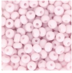
Seed beads 6/0 - 4 mm Opaque Light Rose x20g Ref. : ROC-604 Quantity : 1