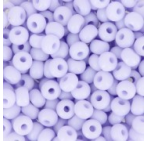
Seed beads 6/0 - 4 mm Opaque Lilac x20g Ref. : ROC-605 Quantity : 1