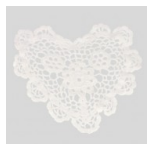
Doily lace heart pattern 20 cm White x1 Ref. : SEW-762 Quantity : 1