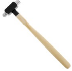
Silver smith Hammer Ref. : OUTIL-475 Quantity : 1