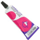
Jewel Glue Hasulith 30ml Ref. : OUTIL-007 Quantity : 1