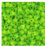
Miyuki Delica 11/0 DB2121 - Duracoat Opaque Kiwi Ref. : DB-2121 Quantity : 1