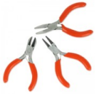
Set of 3 mini pliers Ref. : OUT-918 Quantity : 1