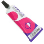
Jewel Glue Hasulith 30ml Ref. : OUTIL-007 Quantity : 1