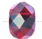
8mm Briolette XL PureCrystal 5042 rondelle bead - Scarlet Shimmer 2X x1 Ref. : WRD-533 Quantity : 1