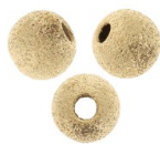
Diamond balls 6mm fine Gold plated x5 Ref. : MET-197 Quantity : 1