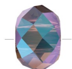
8mm Briolette XL PureCrystal 5042 rondelle bead - Amethyst Shimmer 2X x1 Ref. : WRD-536 Quantity : 1