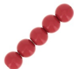
6mm Opaque resin bead - Light Red x10 Ref. : TIQ-921 Quantity : 1