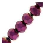
Fire Polished faceted flat round 6x5 mm Purple Iris x40cm Ref. : RVC-328 Quantity : 1