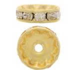
Rhinestones Rondelle 10mm gold tone/Crystal x1 Ref. : RDL-046 Quantity : 1