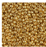
Miyuki Seed beads Duracoat 11/0 4202 - Galvanized Gold Ref. : MR11/4202 Quantity : 1