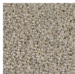
Miyuki Seed beads 15/0 1051 - Galvanized Silver Ref. : MR15/1051 Quantity : 1