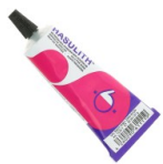
Jewel Glue Hasulith 30ml Ref. : OUTIL-007 Quantity : 1