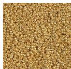
Miyuki Seed beads Duracoat 15/0 4202 - Galvanized Gold x8g Ref. : MR15/4202 Quantity : 1