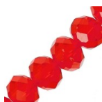
Fire Polished faceted flat round 8x6mm Light Siam x40cm Ref. : RVC-569 Quantity : 1