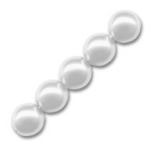
Pearly beads 12mm White x15 Ref. : PEARL-242 Quantity : 1