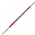
Iris brush - yellow polyamide bristles - n°2 x1 Ref. : PEINT-760 Quantity : 1