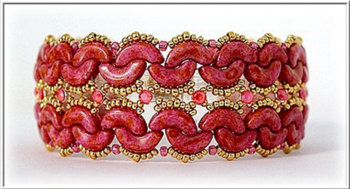
Arcos® Opaque Rose Spotted