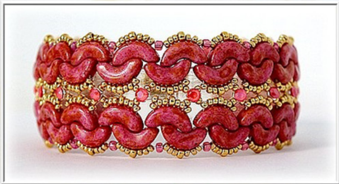
Arcos® Opaque Rose Spotted