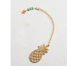
Repeat the steps to create a necklace of approximately 50 to 55 cm.