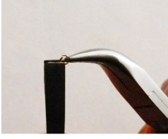
Step 1: Open one of the chain link spacer.