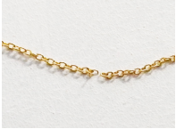
Step 2: Connect the pendant to the chain with an open ring.