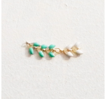
Step 6: Connect your chain piece to the chain with the pineapple.