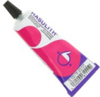
Jewel Glue Hasulith 30ml Ref. : OUTIL-007 Quantity : 1