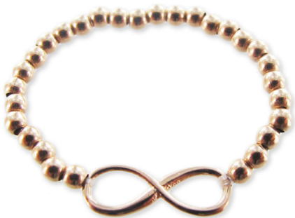
Infinity Rose Gold Filled Ring

Step 1 : Cut ca. 30cm of elastic thread. Put the thread through one side of the infinity symbol and then double your thread. Slip on this double thread ca. 28 2mm round beads (the bead number may vary due to the size of your finger). Then put the thread through the other side of this infinity symbol. Step 2 : Make 2 or 3 Capuchin knots For more explanations to realize this knot, click hier : capuchin knot Let the knot slip in a bead.