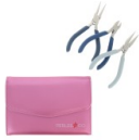
Kit of 3 pliers in Perles & Co pocket Pink x1 Ref. : OUT-335 Quantity : 1