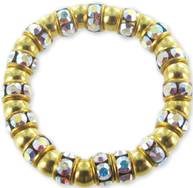
Strass + Gold Filled ring

Step 1 : Cut ca 30cm of elastic thread. Double the thread and slip 16 rondelles with rhinestones and 15 3mm round beads (the bead number may vary due to the size of your finger). You can place 2 rondelles side by side, for a more shiny effect and then you place these both rondelles on the upperpart of your ring. Step 2 : Make 2 or 3 Capuchin knots For more explanations to realize this knot, click hier : capuchin knot Let the knot slip in a bead.