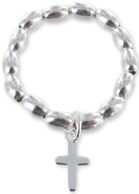
Ring in 925 Sterling silver

Step 1 : Cut ca 30 cm of elastic thread. Double the thread and slip 14 925 sterling silver olives (the bead number may vary due to the size of your finger) and the cross pendant. Step 2 : Make 2 or 3 Capuchin knots For more explanations to realize this knot, click hier : capuchin knot Let the knot slip in a bead.