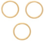
Double jumpings 8x0.7mm Gold tone x50 Ref. : OAC-398 Quantity : 1