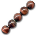
Beads Bull's eye 4 mm x20 Ref. : SP-135 Quantity : 2