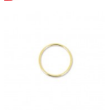
Nude brass circle for Dreamcatcher, Suspension and Lamps 5 cm Ref. : TOOL-609 Quantity : 1