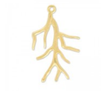
Pendant coral 38mm fine Gold platedx1 Ref. : PDT-787 Quantity : 1