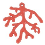
37mm coral pendant - Terracotta x1 Ref. : PEND-897 Quantity : 1