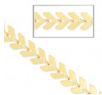
Cobs Chain 6.3 mm Gold Tone x 50cm Ref. : FILC-622 Quantity : 1