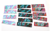
Step 6 After your color release of the 4th screen of your flat and then cut 2 pieces with the same color and other flat 2 to cut them in the 2 you want.