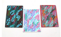
Step 5 All the color release in their order to obtain colors of 1 to 4.