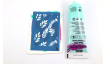
Step 3 Build in the fourth color as well as the last screen to get your flat pattern. Let the whole thing dry.