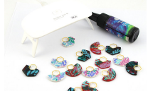
Step 10 Be able to mount our message with some flat made in our studio with a gold leaf. They just have to open the ring of your star shape and press it in the end of the bag, above your bag.