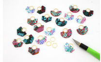
Step 8 Now with a scalpel cut that has a 100% of the edges of your pieces to round off the angles. Be careful not to cut the edges that would have been immediately.