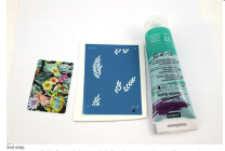
Step 1 Materials for the first application: a small square of patterned clay, a larger square of patterned clay, and a tube of white clay.

Place a stick of water on the surface after coating the pattern with the brush. Then, put the screen on the pattern. Put your release screen on the pattern clay, press gently to release the air and apply your first color. Do not forget to wash your release screen immediately under water with soap.