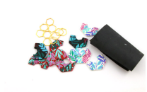
Step 9 The application of several colors on polygon clay requires precision of the parts assembled. You can make a pattern and control them by applying a layer with it with a brush. After the application of the first color, you can add the second. Before the next color, you can use the surface of your mold against with a scalpel to the edges of the pieces, put a 100% of the edges of the pieces and then apply the color. You must carefully avoid the bottom of all your bags because otherwise the application of the next color will change the fact that the resulting flat pattern parts will.