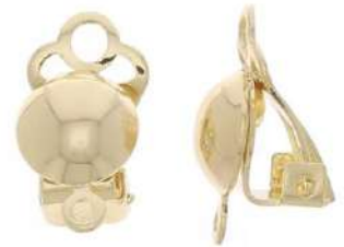
2 Half-ball ear clips