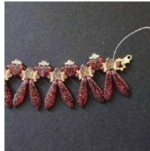
11) You get this