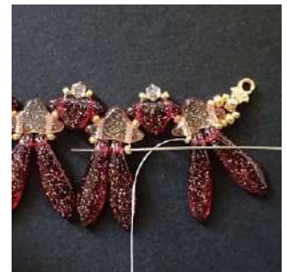
16) Pass into R15, the next 2 Daggers