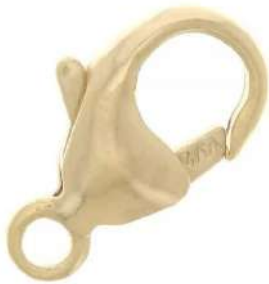
1 Lobster clasp