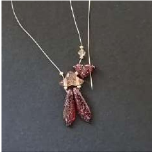
5) Pass into the 2nd hole of the Helios