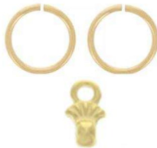
6 Rings 4 mm 4 Cymbal Pilos