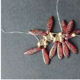
13) Place 1 P3, 1 R15, 1 P3 in the R15, and the Daggers