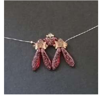
8) You get this