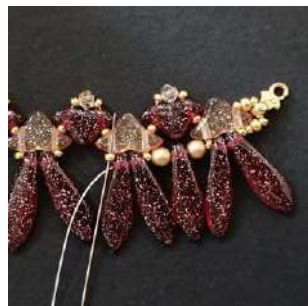
18) Pass into R15