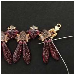
13) Pass into R15, the 2 Daggers 14) Pass into R15