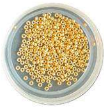
Seed beads 15/0 (R15) Seed beads 11/0 (R11)