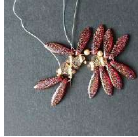
14) Pass into the Daggers, the R15, the Helios, the R15, the Helios, the R15