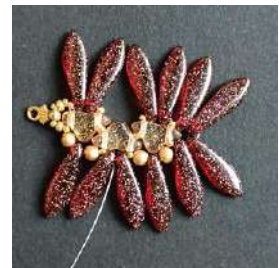
24) You get this