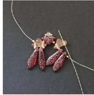
7) Pass into the 2nd hole of the Helios