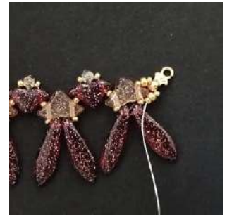
12) Repass into all the beads