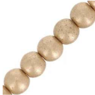
41 Round Beads 3 mm (P3)