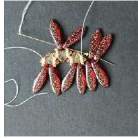
10) Pass into R15 and the Daggers once again