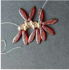
9) You get this