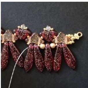
17) This is what you get