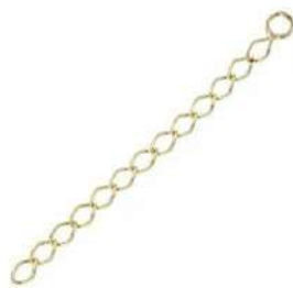
1 Extension chain