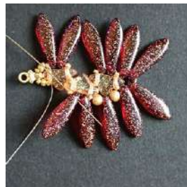
23) Pass into the R15, the next Dagger