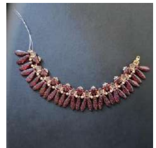
20) This is what you get