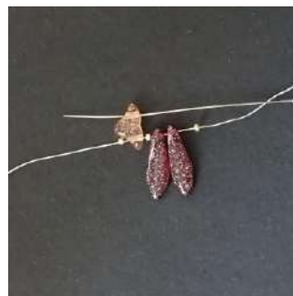
2) Pass into the second hole in the Hélios