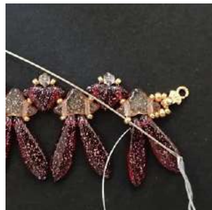
14) Pass into R15