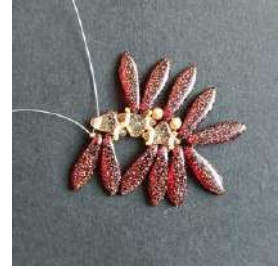
16) Pass into the Helios