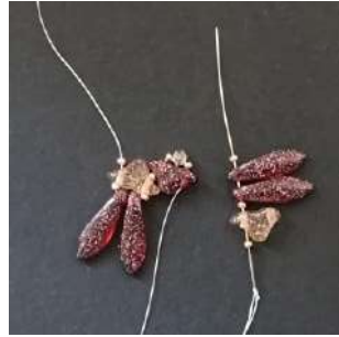
6) Place 1 R15, 1 Helios, 1 R15, 2 Daggers, 1 R15