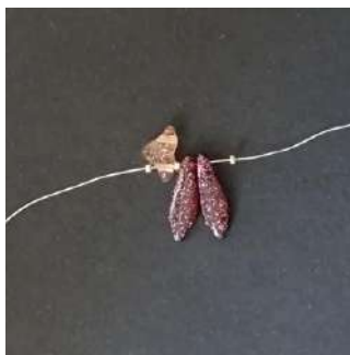
1) Place 1 R15, 1 Hélios (in this position), 1 R15, 2 Dagers, 1 R15