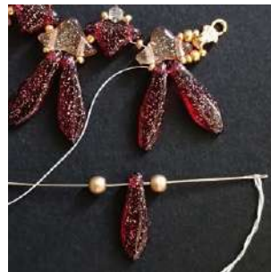
15) Place 1 P3, 1 Dagger, 1 P3