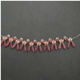
9) Repeat steps 4 to 7 (5 times) like this