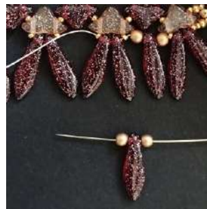
19) Repeat step 15 all the along