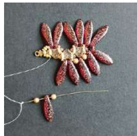
22) Place 1 P3, 1 Dagger, 1 P3