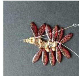
20) Pass through the seed beads