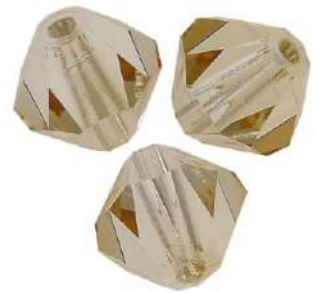
9 Bicones 3 mm (T3)