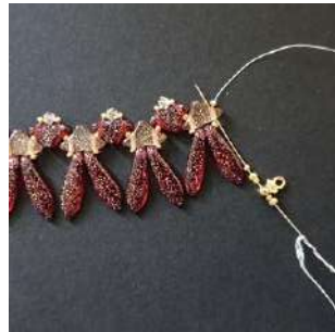
10) Place 1 R15, 1 R11, 1 R15, 1 Pilos, 1 R15, 1 R11, 1 R15 into the 2nd hole of the Hélios