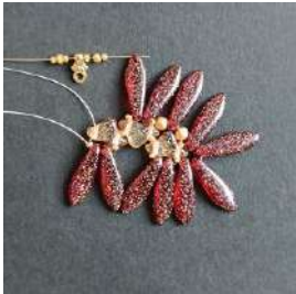
17) Place 1 R15, 1 R11, 1 R15, 1 Pilos, 1 R15, 1 R11, 1 R15