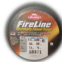
Thread Fireline 0.12