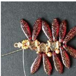
21) Pass into the Pilos, the seed beads