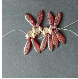
11) Like this