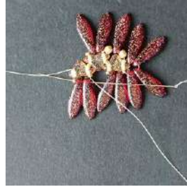
15) Pass into the 2 Daggers, the R15