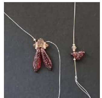
4) Place 1 R15, 1 Hélios, 1 R15, 1 T3, 1 R15