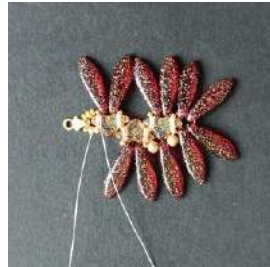
18) Tie a double knot with the remaining thread