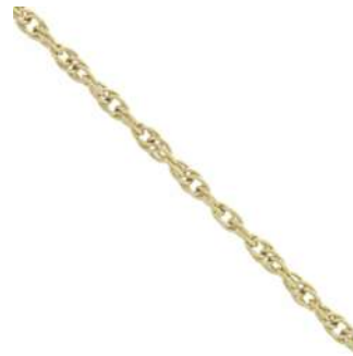
1 Chain 40 cm