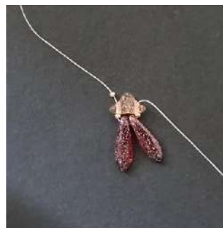
3) You get this