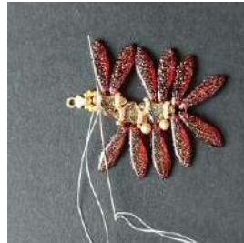
19) Pass into the Helios