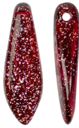
55 Dagers FP Selection®