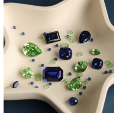
PureCrystal: Swarovski crystal for everyone

PureCrystal crystals are exactly the same as Swarovski crystals. The only difference is the name.