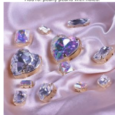
Preciosa: Czech excellence

The Czech brand Preciosa is an institution in the world of crystal. Founded in Jablonec nad Nisou in Bohemia, it is renowned for the quality of its pearly beads and the precision of its cutting.