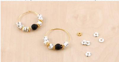
Mini creeples with Heishi dalmatian rondelles and matte onyx stone

On the other hand, onyx should not be worn with stones that are too powerful and energizing, such as turquoise, malachite, peridot or tiger's eye.