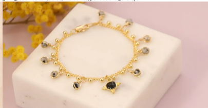
Gold chain bracelet with black onyx and sesame jasper charms