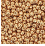
Rocaille Miyuki Duracoat 8/0 4203 - Galvanized Yellow Gold x8g Ref. : MR08/4203 Quantity : 1