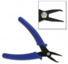
Specialized split Ring Pliers Ref. : OUTIL-030 Quantity : 1