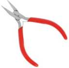
Chain Nose pliers Ref. : OUTIL-467 Quantity : 1