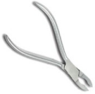
Specialized loop closing pliers Ref. : OUTIL-473 Quantity : 1