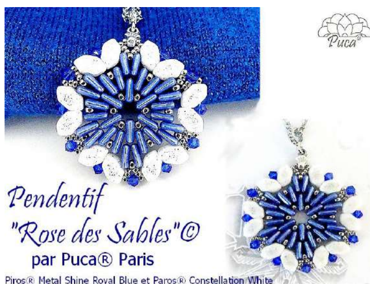
Pendentif "Rose des Sables" © par Puca® Paris

Piros® Metal Shine Royal Blue et Paros® Constellation White